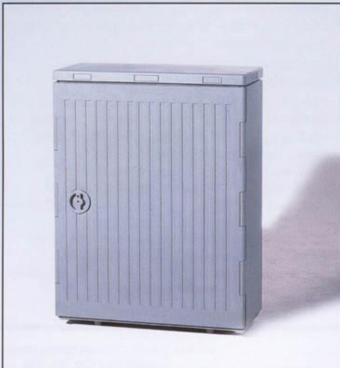
YAK-50/1 (Type 82; one door)

The used metal parts are made of stainless steel or alternatively provided with a surface protection, e.g. galvanized or chromatized.