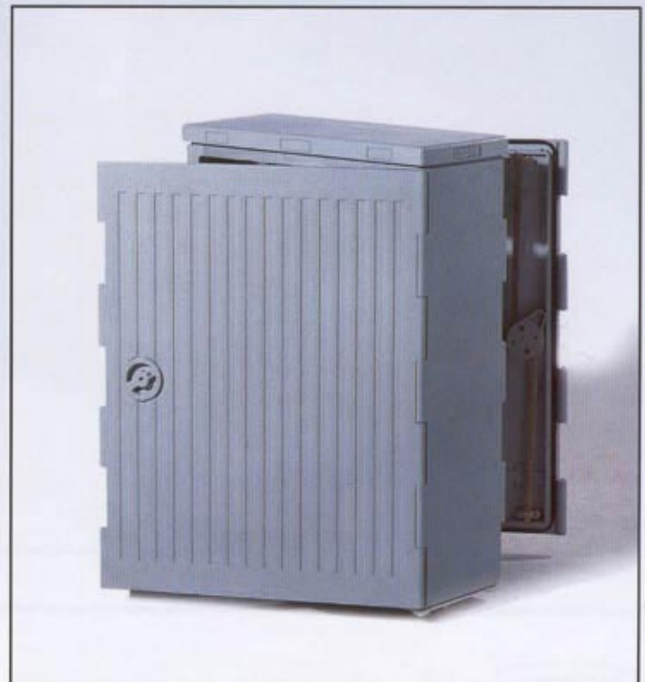
YAK-50/2 (Type 82/2; two doors)